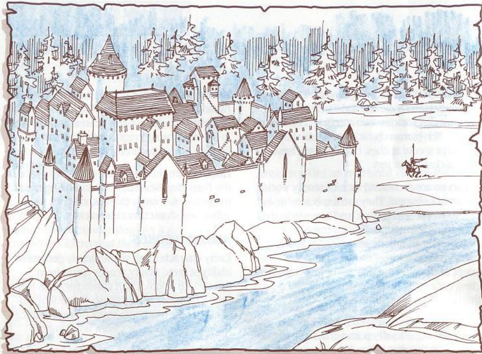
The Great Walled City of Zhentil Keep

Charisma (Cha) is the measure of how well the character interacts with others. Charisma is sometimes a factor when the character has an encounter with NPCs.