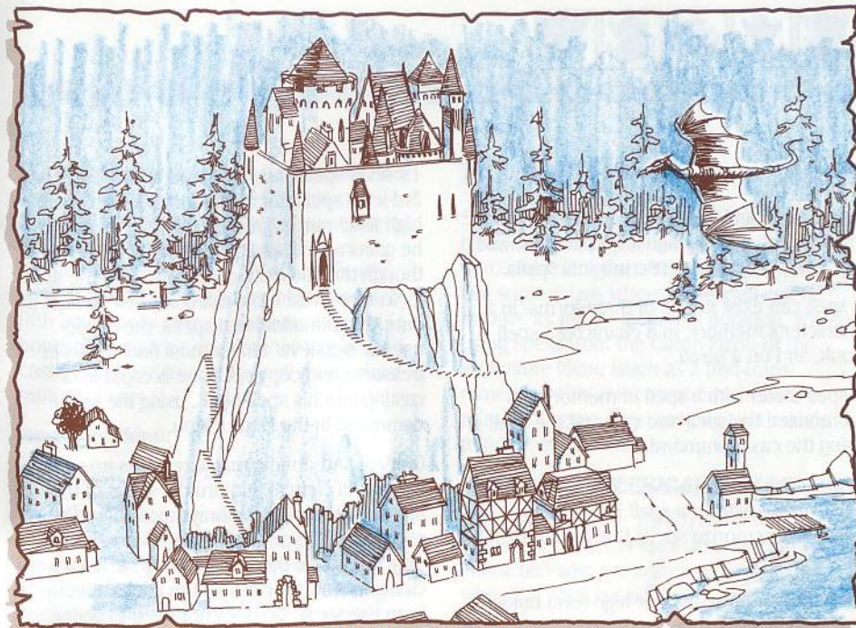
The Village of Hap

• Speed changes the game speed and is described under the alter command in the Camp Menu.