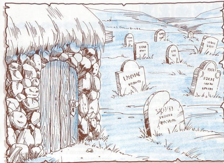
The Myth Drannor Burial Glen